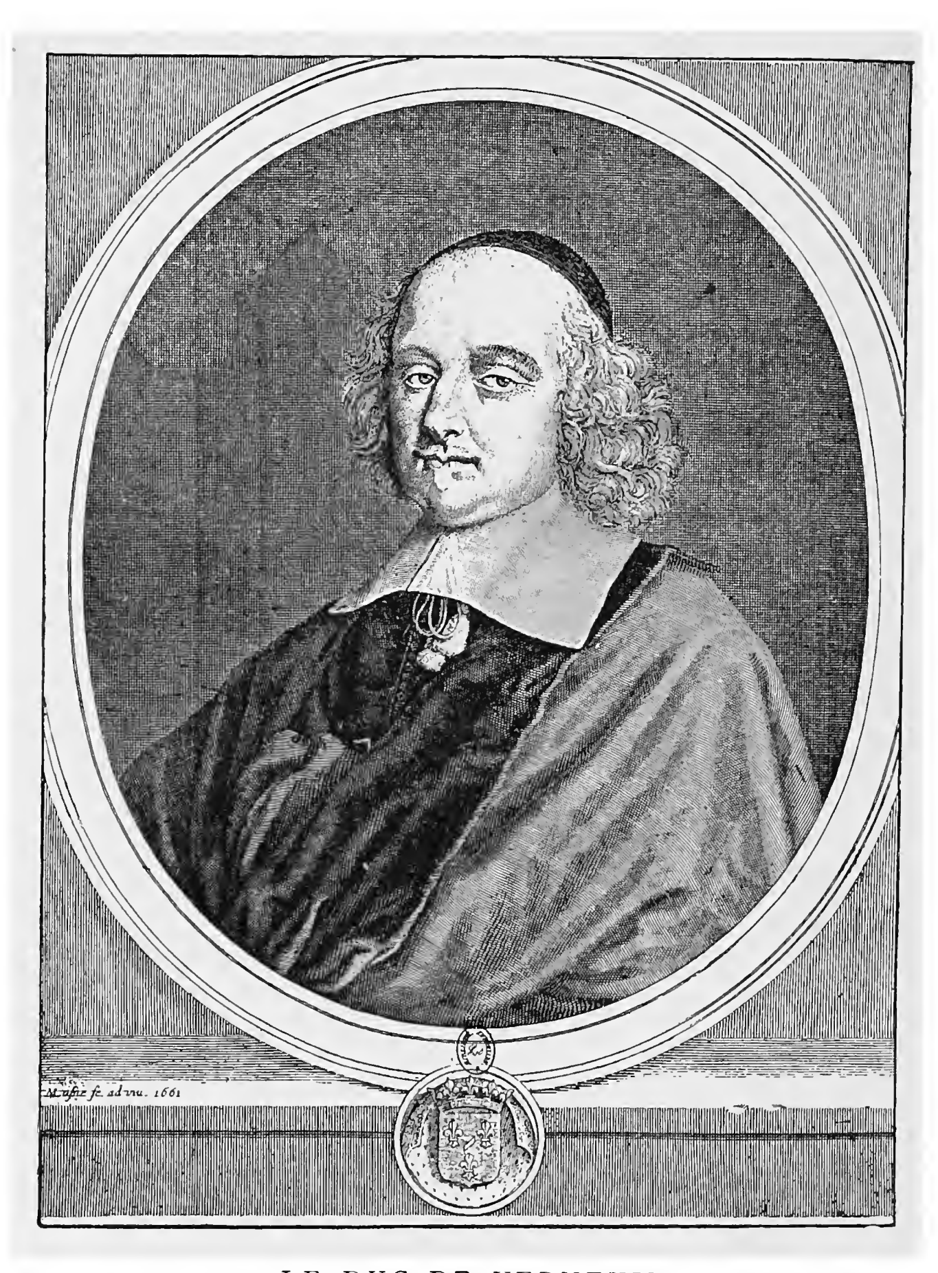
LE DUC DE VERNEUIL